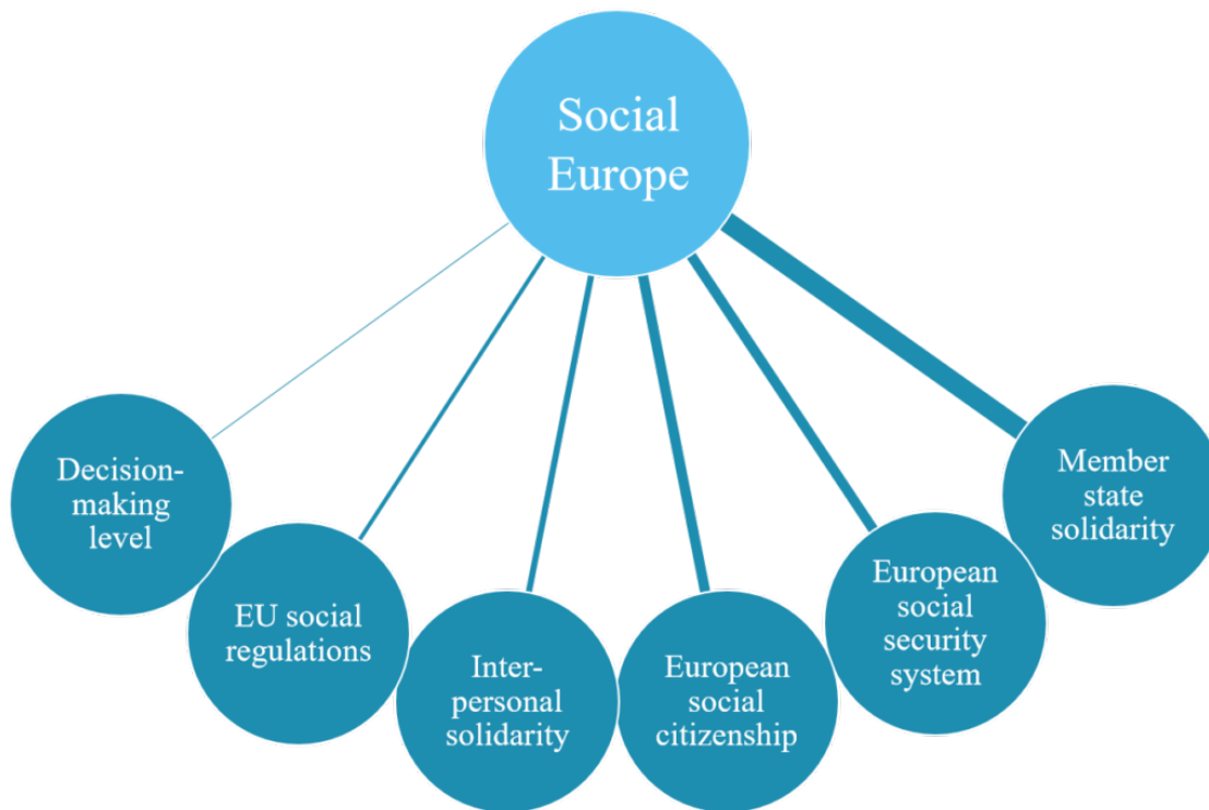
Figure 2: The different components of citizens' attitudes toward Social Europe (confirmatory factor analysis, N= 1403).

The results show very clearly that, in citizens' view, member state solidarity is at the core of Social Europe . In other words, a general pro-Social Europe attitude is mainly an expression of citizens' idea that the richest member states of the EU should support the less-affluent ones and those countries facing economic difficulties. The central role of financial support between member states indicates that citizens interpret Social Europe primarily as something interstate related, instead of a socially integrated European space without national boundaries. The intense media attention paid to the bailouts of over-indebted Eurozone countries in recent years quite probably also activated member state solidarity as the primary aspect of Social Europe in citizens' minds.