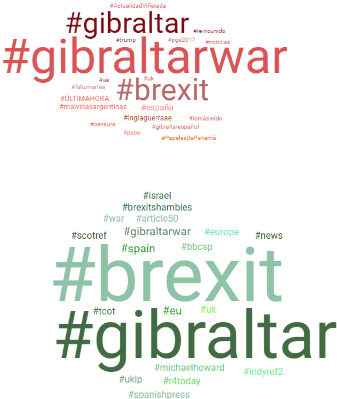
Figure 3: Most frequent hashtags by language - Spanish and English

It appears that the territorial claim is still an hot topic among spanish commentators, which