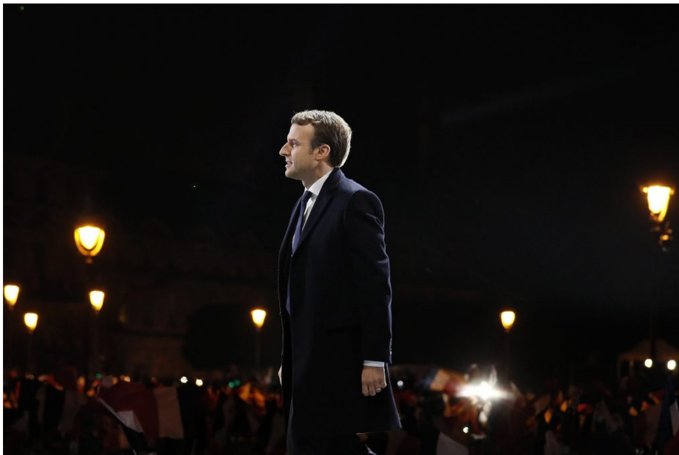
Emmanuel Macron during the French Presidential election night, shortly after being elected President of the Republic

Secondly, the divides between solidarity and responsibility , and between free movement and national closure , are related to the issue of European social unity . The first distinguishes those who claim that the European institutions should foster the principle of interstate solidarity from those claiming that the principle of self-help should prevail, whereas the second relates to the level of social protection to be accorded to intra-European migrants. In both cases, the French President finds his opponents in the Eastern governments, as they benefit the most from their lower social standards.