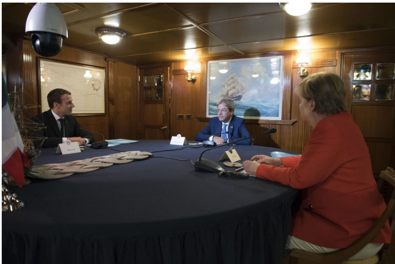
Trieste, 12/07/2017 - Trilateral meeting: Paolo Gentiloni, Emmanuel Merkel, Angela Macron